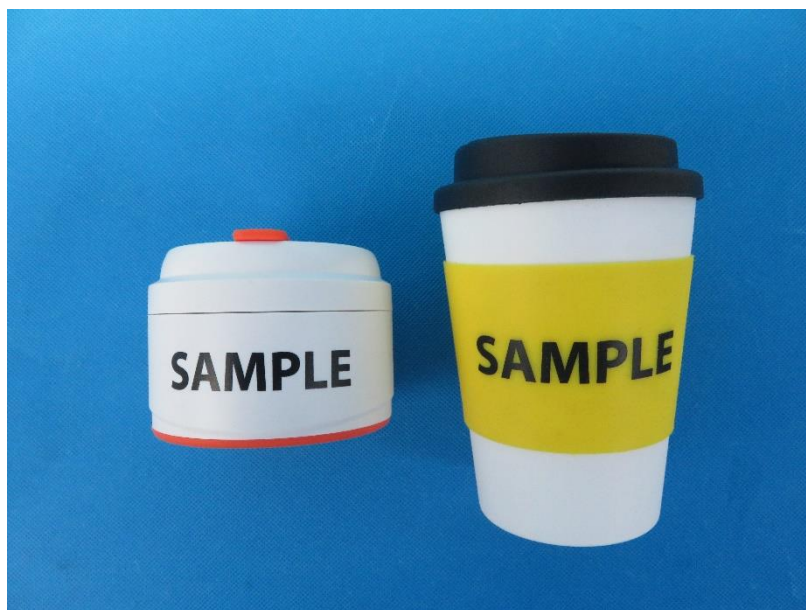
Fig.1 (Finished photo)