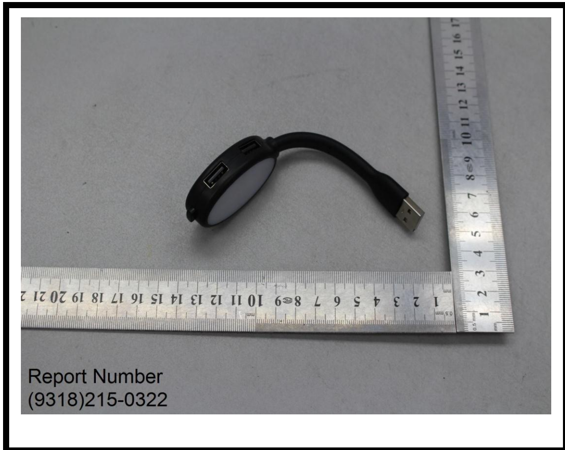
Photo of the Submitted Sample

LAB NO. : (9318)215-0322-R1 DATE : Aug 23, 2018 PAGE : 3 OF 10